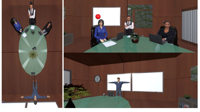
(b) Virtual meeting room