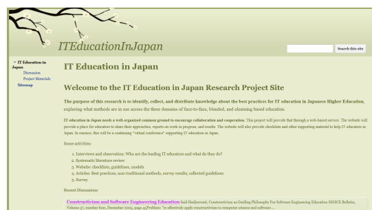
Figure 1. IT Education in Japan Website

Third, it seems to me that communication models or skills need to be considered when thinking about learning. The basic skills of encoding and decoding communications, the more advanced skills of organizing ideas and concepts and presenting them, and other communication skills are critical parts of the educational process that are often ignored. This is where the teacher and students meet and form the learning community that creates the experiences used for reflection and construction of understanding, and the methods, verbal, visual, and other modes available now, need to be considered.